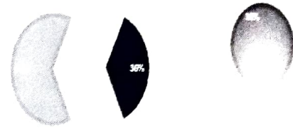
Table No. 2 NEP Promotes for Research