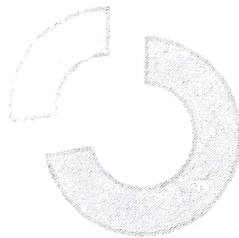
Table No. 3 NEP Promotes Employability