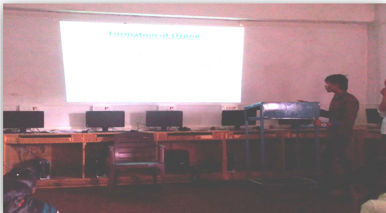
Fig.1:2 Mallade vicky giving speech on world ozone day from BSc T Y Class.