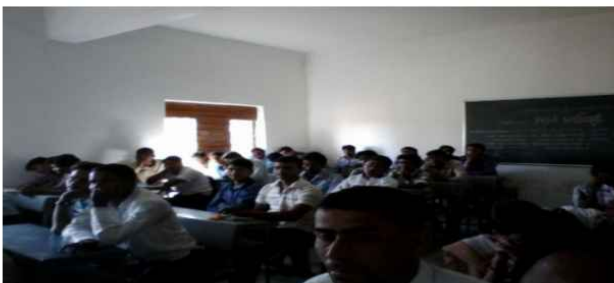
(All Geography Students.)