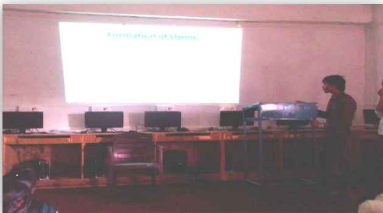
Fig.1:2 Mallade vicky giving speech on world ozone day from BSc T Y Class.