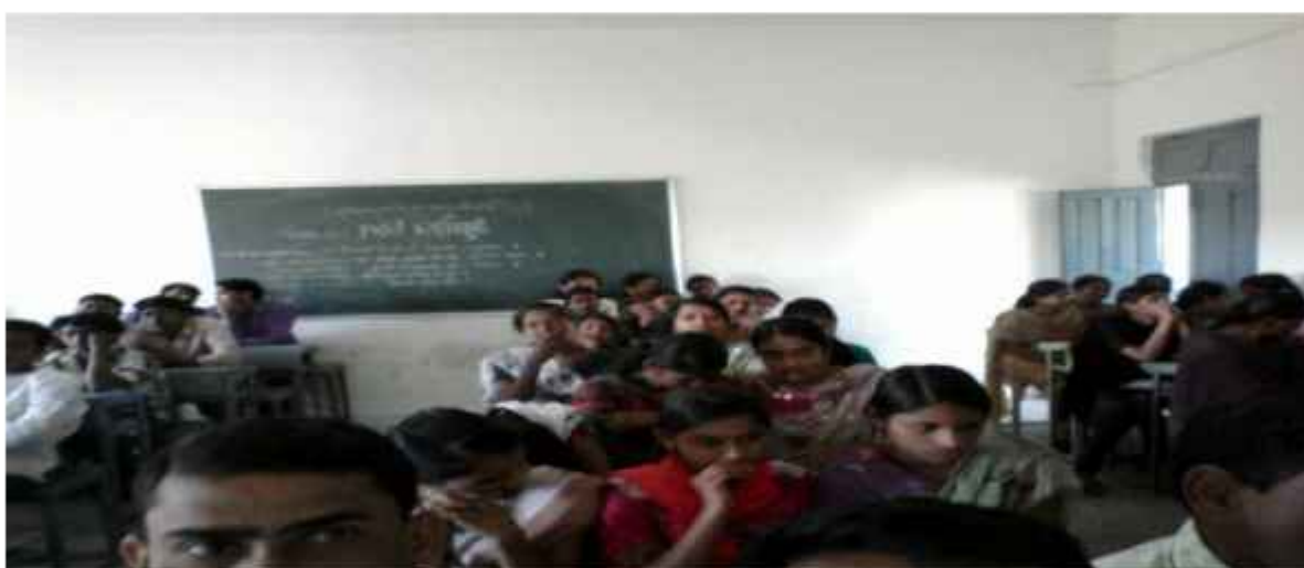
(All Geography Students.)