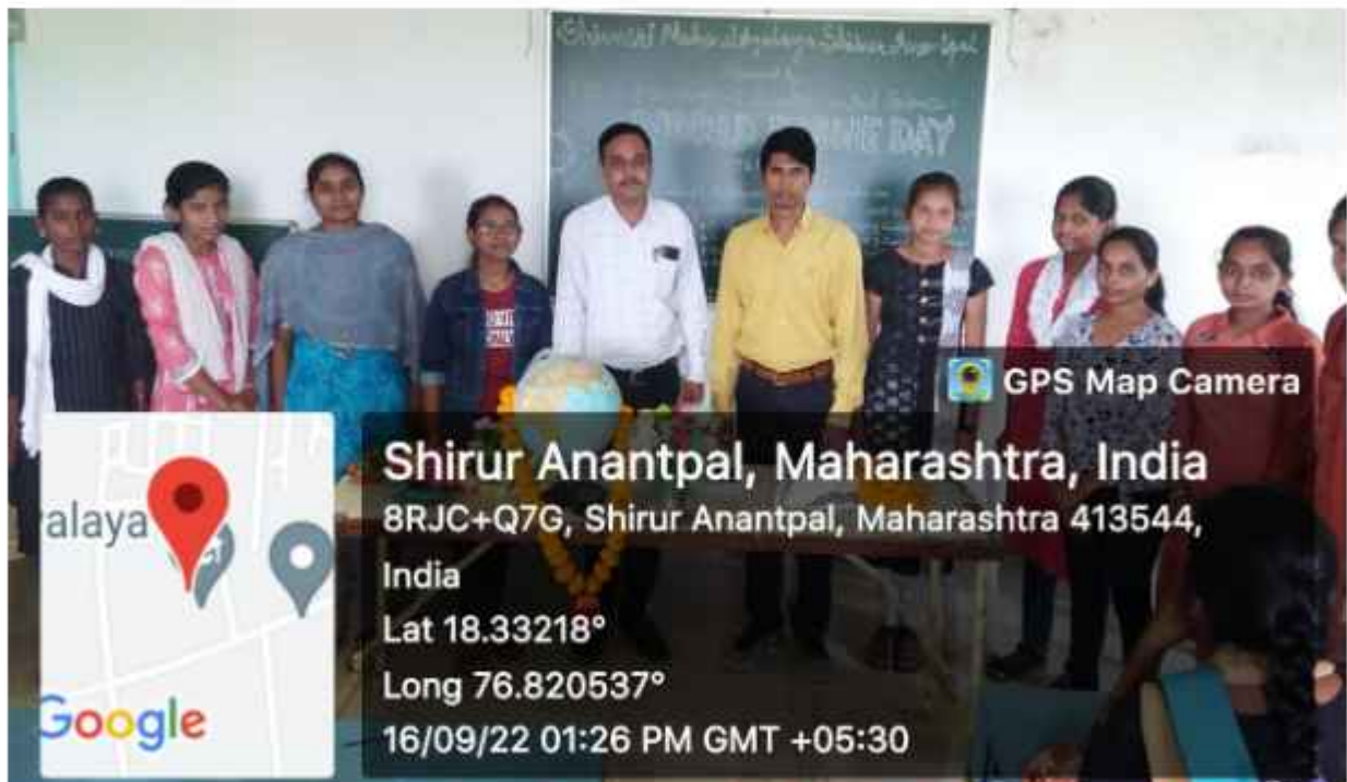
A Group photo of Students and Faculty members of Dept. of Env. Science on the occasion of International Ozone day programme