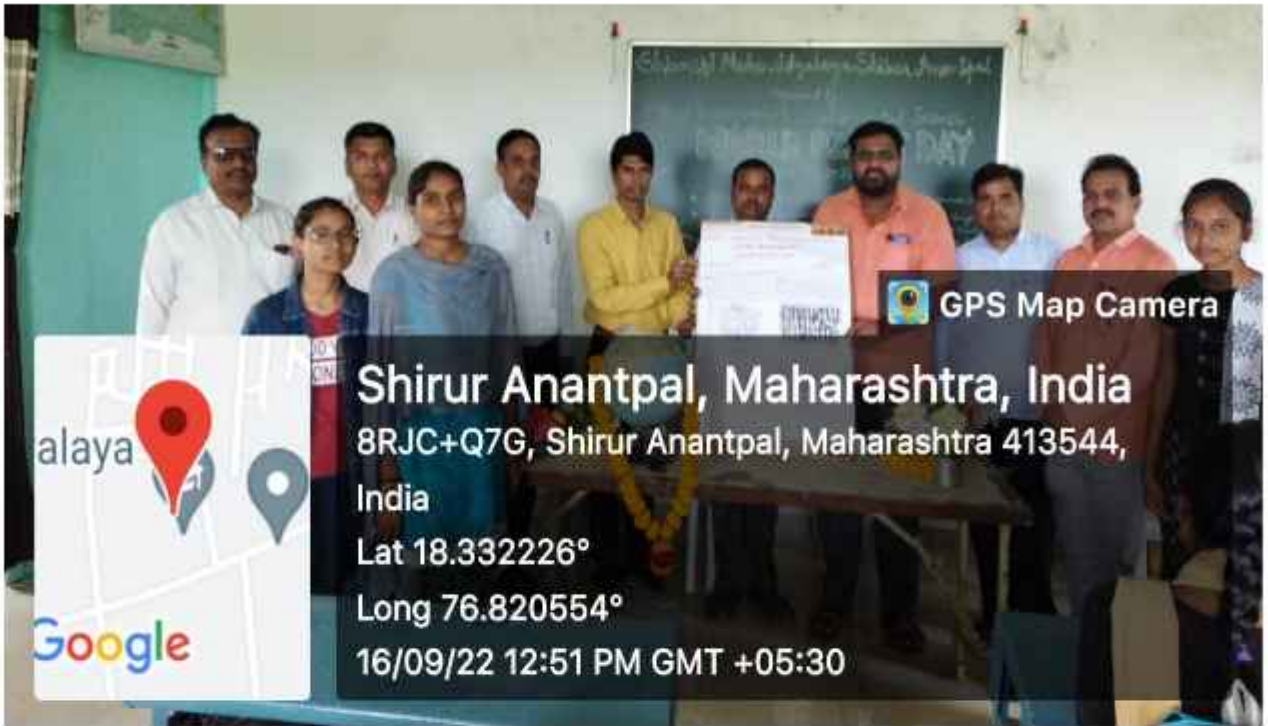
Inauguration of Poster prepared by B.Sc-I students on Ozone Day